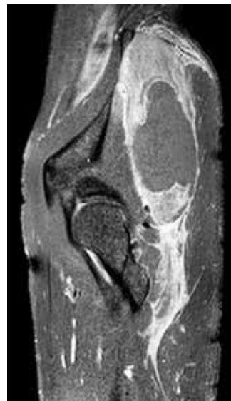
Figure 3 demonstrate a sagittal T1W with Gd.